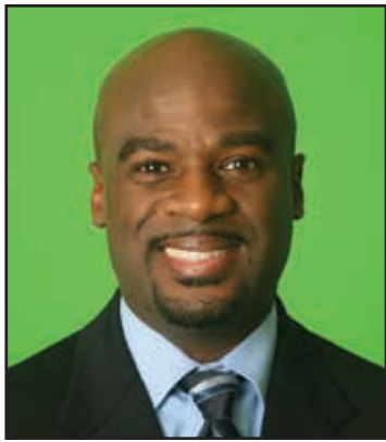
Senator Kelvin Atkinson, Chairman of the Senate Commerce, Labor and Energy Committee